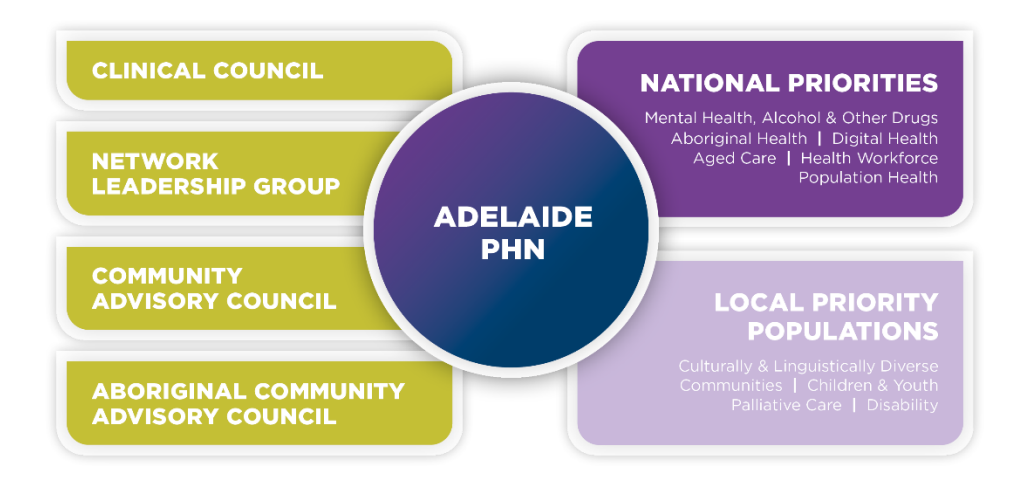
Figure 3: Adelaide PHN Membership Model

In addition to engagement of external stakeholders through the Membership model, Adelaide PHN also communicates and consults with a diverse range of stakeholders across the health and related sectors to inform service planning, commissioning activity and decision making.